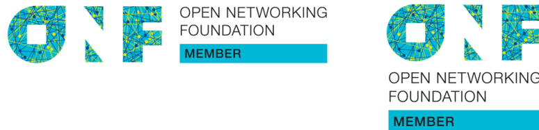
FIGURE 6 ONF Member Logo (available in two configurations)