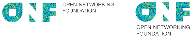
FIGURE 2 ONF Logo (available in two configurations)